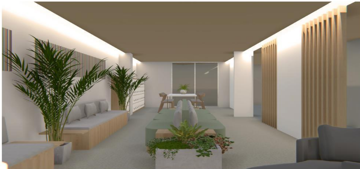
FAMILY ROOM - INTERIOR VIEW