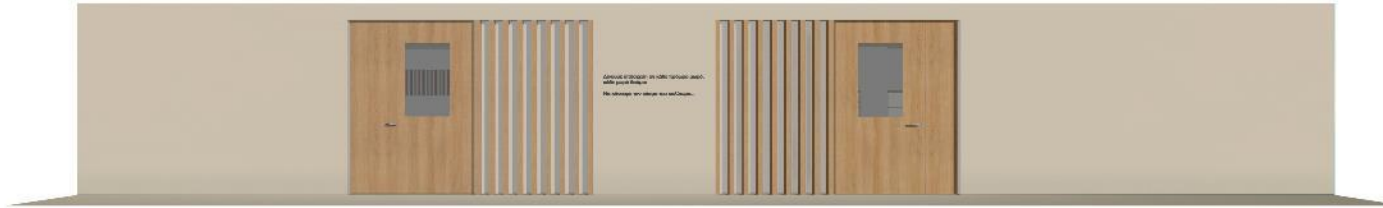
FAMILY ROOM - FRONT VIEW